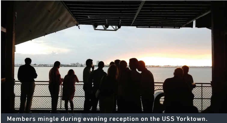
Members mingle during evening reception on the USS Yorktown.