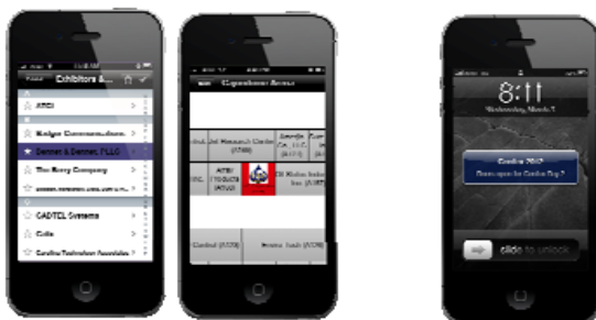
Highlighted Exhibitor Listing and Logo Placement/Colored Background on Floor Map