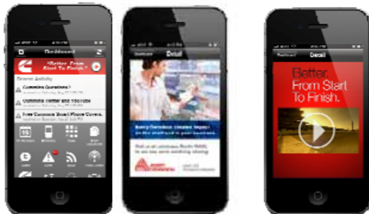
Banner Ad & Full-Screen Landing Page