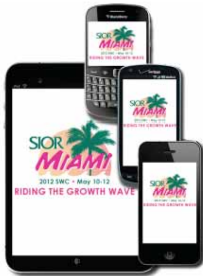
Secondary full-screen splash page appears every time someone opens the app.