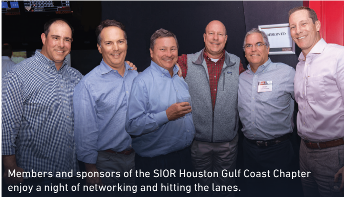
Members and sponsors of the SIOR Houston Gulf Coast Chapter enjoy a night of networking and hitting the lanes.