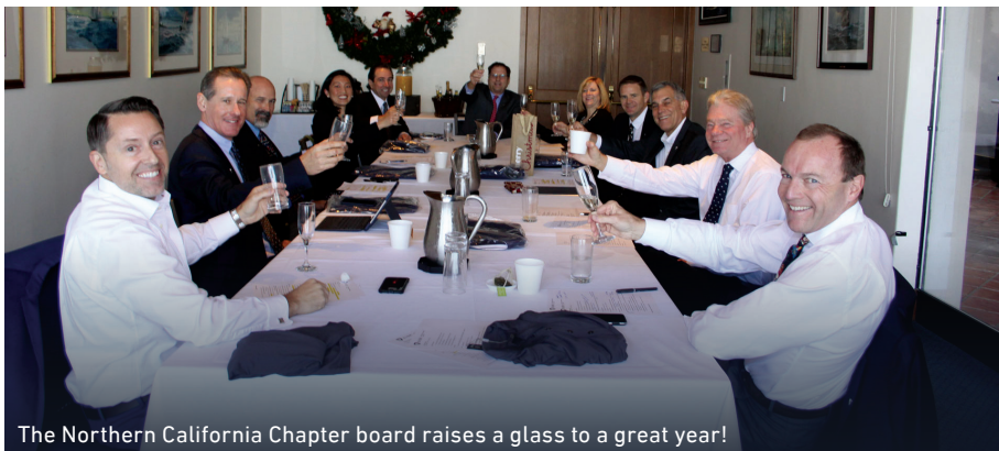
The Northern California Chapter board raises a glass to a great year!