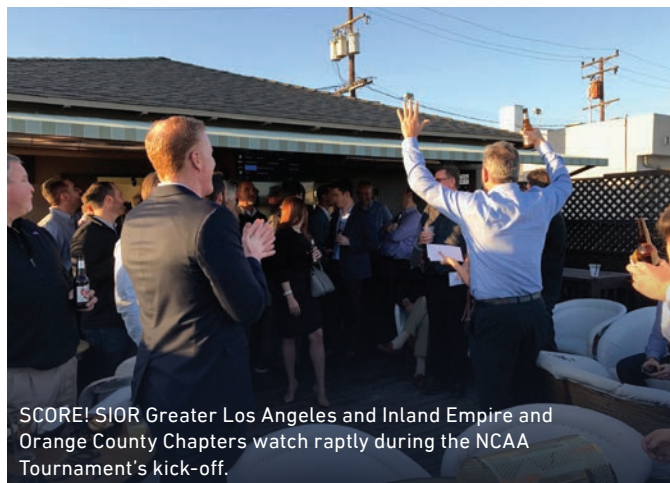
SCORE! SIOR Greater Los Angeles and Inland Empire and Orange County Chapters watch raptly during the NCAA Tournament's kick-off.