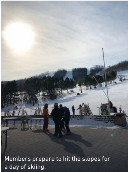
Members prepare to hit the slopes for a day of skiing.