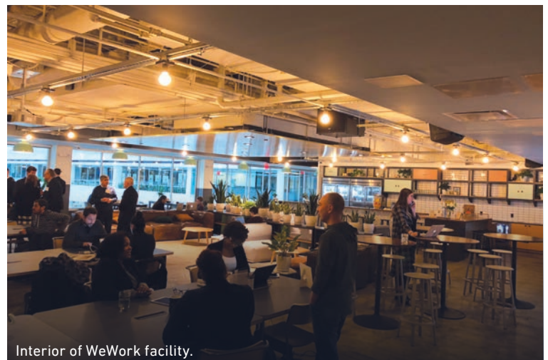
Interior of WeWork facility.

In January, the SIOR Philadelphia Chapter hosted 20 members and their guests at the incredible WeWork space in Philadelphia. The Philadelphia center the chapter toured contains 55,000 square feet of beautifully designed collaborative space that offers countless amenities and opportunities for companies and their employees. WeWork operates centers in 65 cities worldwide.