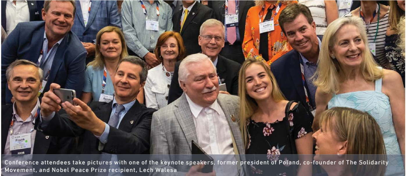
Conference attendees take pictures with one of the keynote speakers, former president of Poland, co-founder of The Solidarity Movement, and Nobel Peace Prize recipient, Lech Walesa

The SIOR European Regional Chapter held the second SIOR International European Conference in the Sofitel Warsaw Victoria Hotel, Poland on June 27th – 29th, with nearly 200 SIOR members, real estate colleagues, and guests attending from 17 different countries. The Chapter was also pleased to offer two places at the conference to students of the University of Reading, thanks to the SIOR Foundation's Student Real Estate Experience Program.