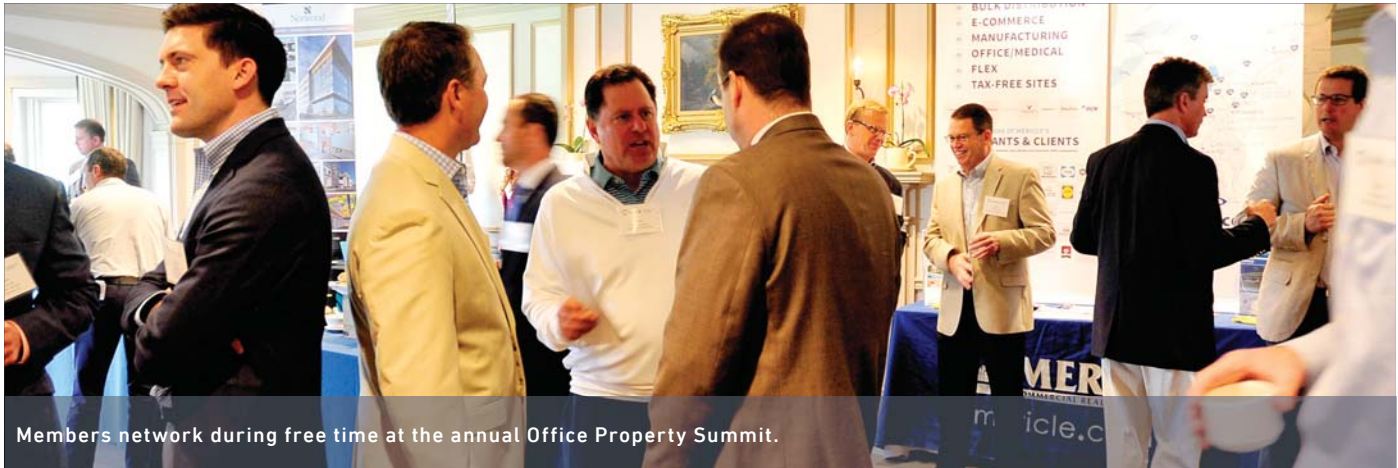
Members network during free time at the annual Office Property Summit.